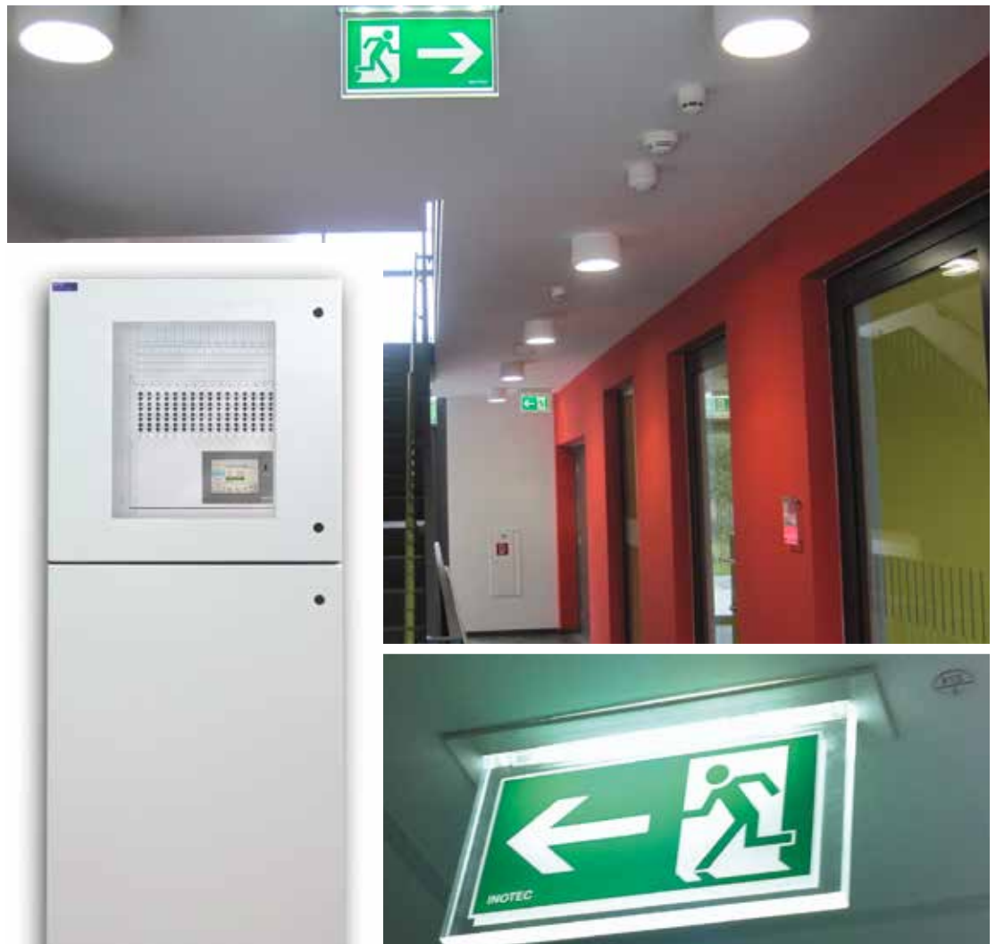
Figure 2: In emergency illumination systems (in the background you see a corridor in the Landesgymnasium für Musik Dresden (Dresden-based music high school of the state of Saxony)); the technology was supplied by Klett Ingenieur GmbH) systems of high-capacity common batteries are applied; on the left side you see Inotec's CPS220/64. When, in the case of a mains failure, these batteries have to stand in by supplying emergency power, the fuses may have to be able to cope with high DC short-circuits

A very typical field of application for fuses are the DC voltage circuits of emergency current supplies or emergency light systems. Very often, such systems are special in another way – in the normal operating mode, the systems are supplied with the typical mains voltage of 230 V AC, which, as such, does not present the fuses with a special challenge. It is only when the plant has to operate in the